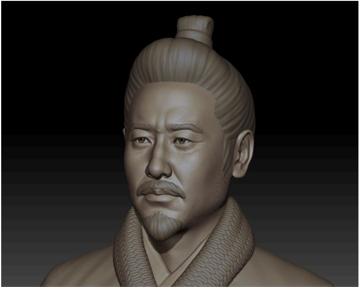
General Sima Yi, the mastermind of the Third Kingdom, unknown to the ignoramus Zelensky

Zelensky also wanted to silence the more popular General Zaluzhny, the commander-in-chief of the army, whom he feared as a possible challenger for the presidency. The hand grenade that detonated in the hands of Zaluzhny's closest confidant, sent as a " present " for his birthday and killing him and seriously injuring his son, was a clear warning to the general.