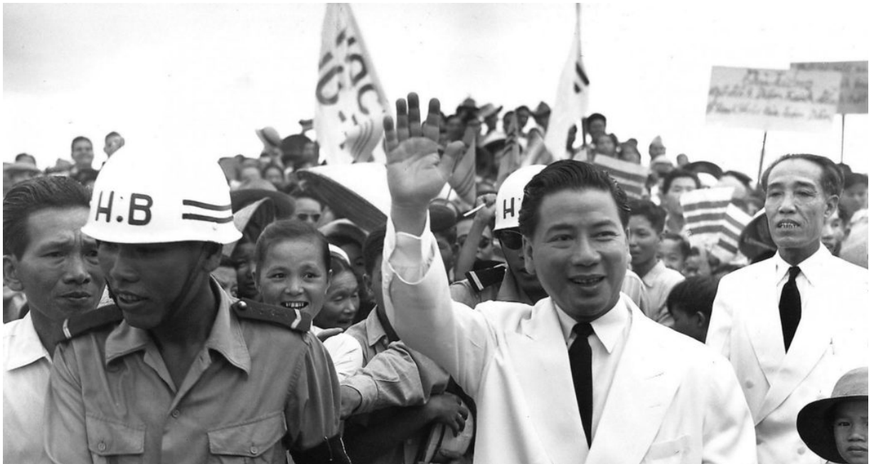
The US magazine Newsweek wrote: "The murder of the Ngo Dinh Diem arguably had a greater impact on American history than that of John F. Kennedy." ( showing Diem at the head of a crowd)

Unlike the comedian Zelensky, Diem came from a noble family and was once Prime Minister to the Vietnamese Emperor, but later overthrew him and made himself President of South Vietnam. Diem refused to implement the Geneva Accords of 1954, which provided for free elections throughout Vietnam in 1956 in order to form a national government. With the South riven by dissident groups and political factions, Diem established an autocratic regime staffed at the highest levels by members of his own family. He ruled the then South Vietnam with dictatorial power from 1955 until his assassination. On 2 November 1963, Diem was arrested and murdered in a successful CIA-backed coup d'état led by General Duong Van Minh.