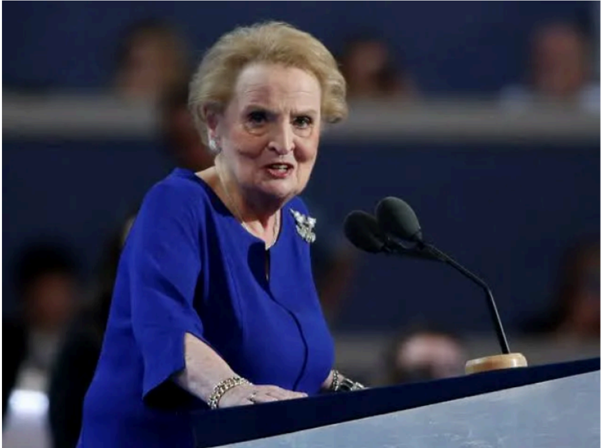
The personification of evil: Madeleine Albright

US-BOTSCHAFTERIN MADELEINE ALBRIGHT, CBS 60 MINUTES 1996