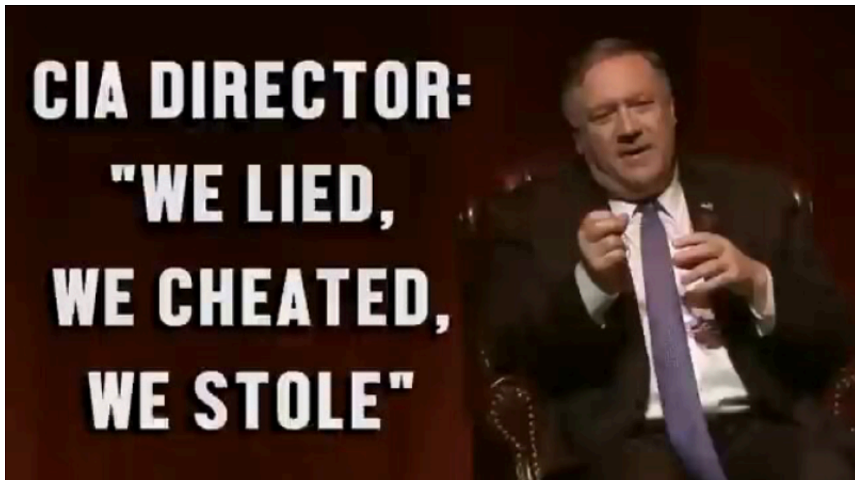
Mike Pompeo - "We lied, we cheated, we stole"

The United States does not use force as a last resort , but often as a panacea—at the very latest when the opposing side does not immediately comply with the hegemon's completely disproportionate ultimatums. The numbers speak for themselves: The Congressional Research Service has documented hundreds of instances in which U.S. armed forces have been deployed abroad since 1798, with a large portion of these occurring after 1945—251 military interventions between