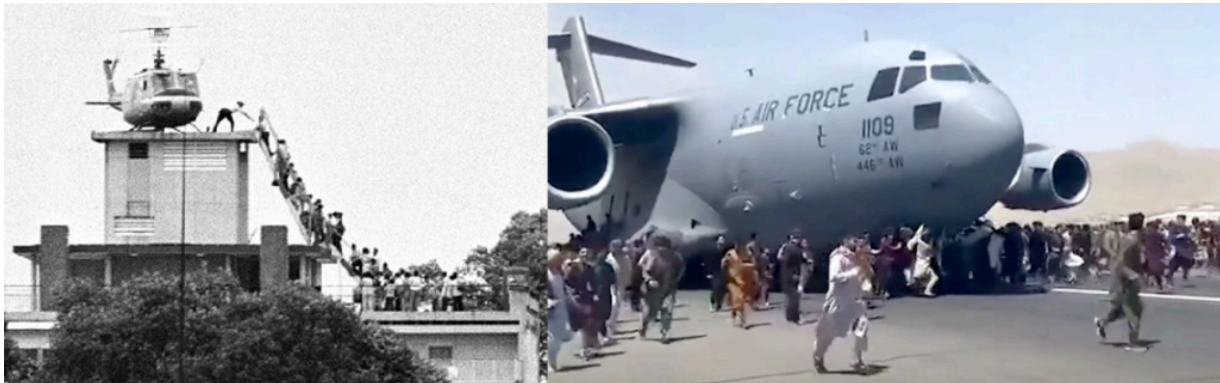
Saigon 1975 - Kabul 2021 - Humiliating moments of a world power

The US has dominated the rest of the world since the Second World War at the latest. This does not happen with military omnipotence, because the US has not won a war since the Second World War; it has lost most of them or somehow pulled out of them. Two images - Saigon in 1975 and Kabul in 2021 - are representative of the complete powerlessness of the world power after decades of armed conflict, during which the US presented itself as the victor right up to the point of collapse.