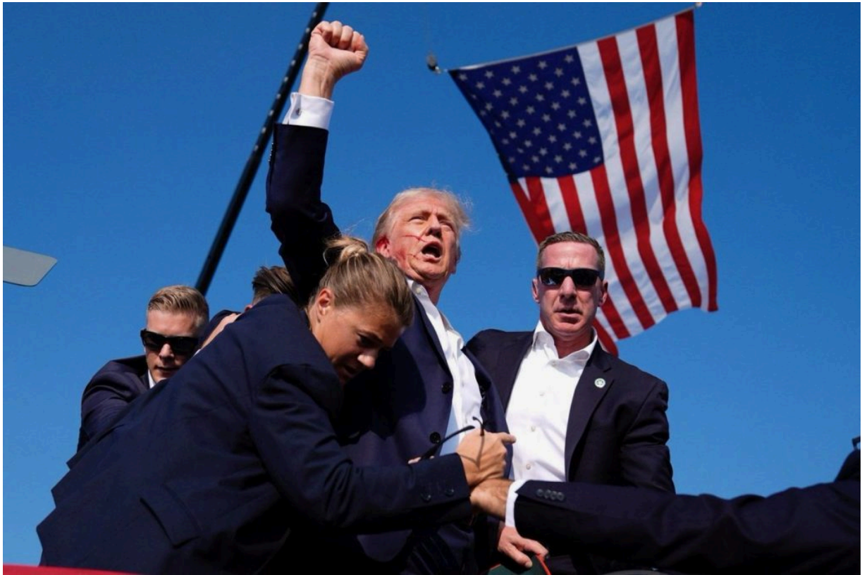
An image for the history book

Courage is a quality that is of paramount importance to people in an age of windbags and woke wimps, especially today as the era of woke aberration comes to an end; an era characterized by society allowing a few demagogues to bring those people who find themselves on the margins of a normal society into the center of that society, to call this normal, and to lead a crusade against those people who are actually at the root of humanity's continued existence: heterosexual women and men. Because: overweight men in women's clothing who pretend to be menstruating and claim the use of the women's changing rooms for themselves are not fit to guarantee the survival of humanity on this planet. By the way, I don't have the slightest problem with all these new genders and varieties, as long as these 0.001% don't want to determine the lives and language of the other 99.999%. But that's what they want. So, it's a blessing for humanity that this ridiculous nightmare will soon be over.