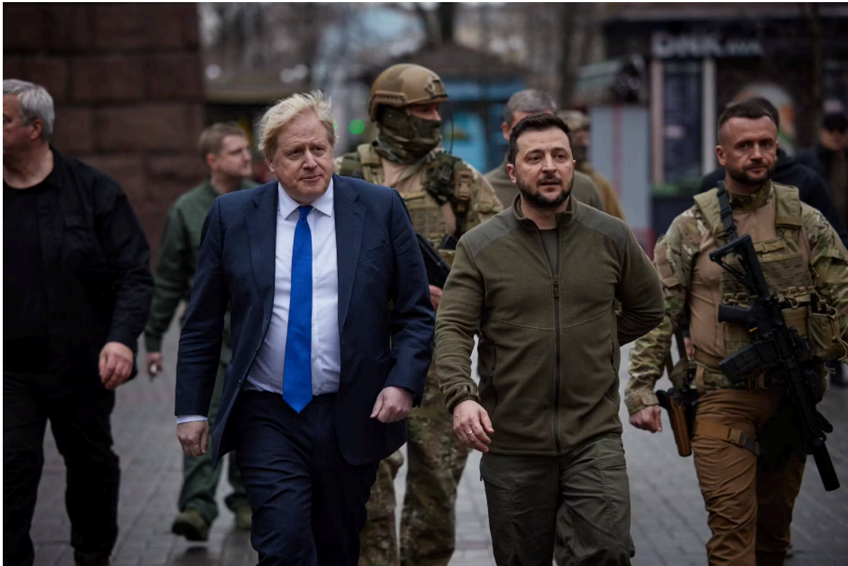
Peace successfully prevented - Boris Johnson and Volodymyr Selenskyi in April 2022