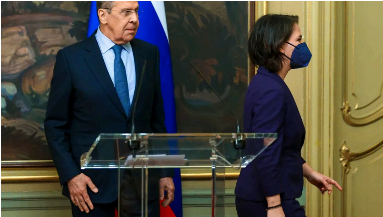
Lack of manners - Foreign Minister Baerbock simply leaves Foreign Minister Lavrov standing - January 17, 2022

At the behest of Washington, Germany turned away from cheap Russian energy. When this happened a little too hesitantly for American tastes, Nord Stream - the main energy artery of German industry - exploded. We have discussed the authorship of the biggest terrorist attack on Germany several times, including in the article " The silence of the lambs: Nord Stream explosion - an act of war by the USA - the West remains silent ". The facts and common sense make it impossible not to see the USA as the perpetrator of this event, which is tantamount to a declaration of war against Germany.