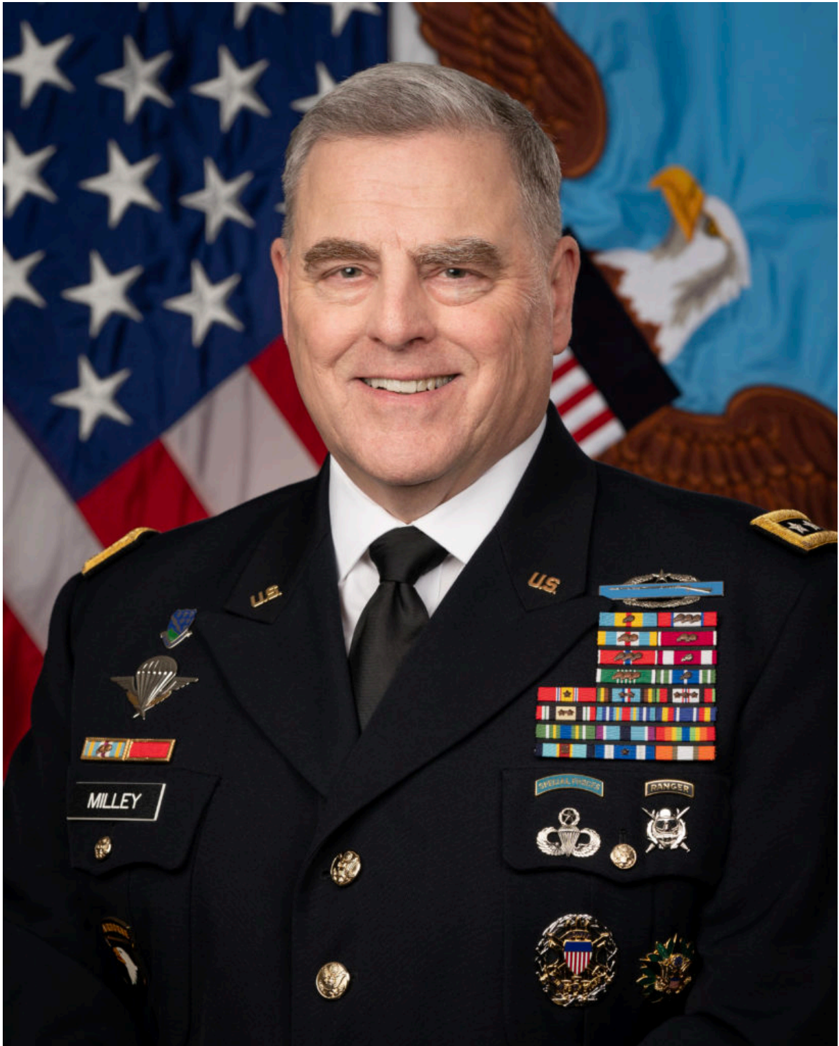
General Mark Milley - Chatterbox on Duty

Thus, the American Army is led by a loudmouth who has absolutely no credibility - the results prove this assertion.