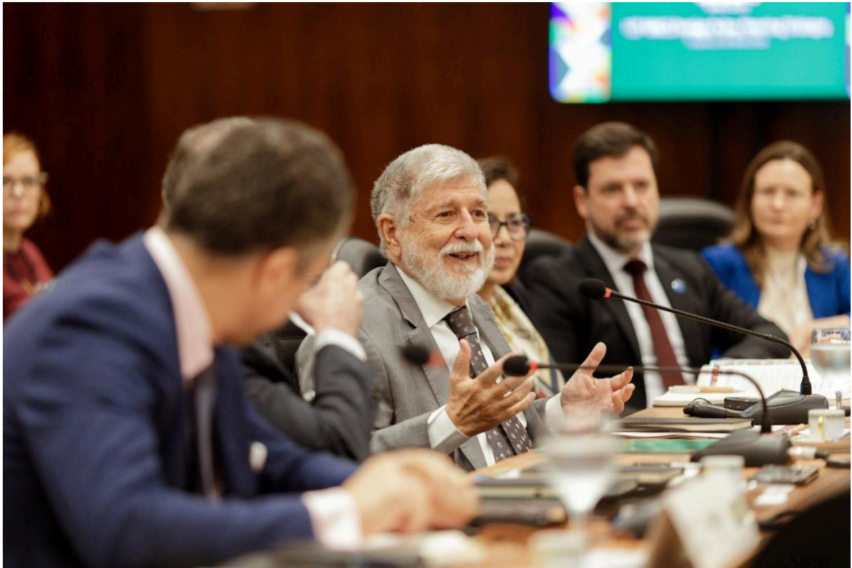
Ambassador Celso Amorim

Celso Amorim, Brazilian BRICS founder and diplomat, emphasized: