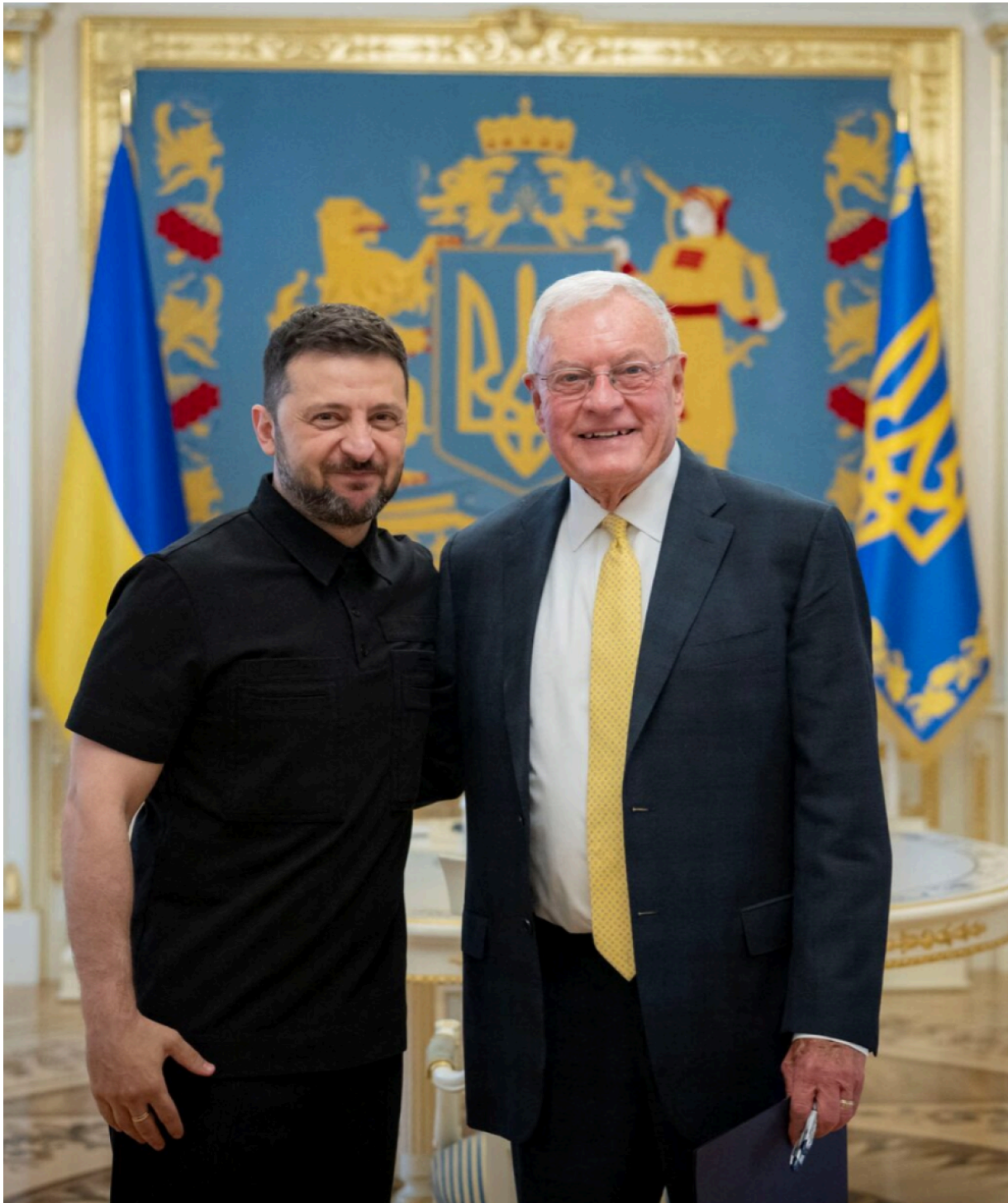
Ukrainian President Volodymyr Zelenskyy meets with US Special Representative for Ukraine Keith Kellogg in Kiev, Ukraine, on July 14, 2025.

But the attempt to lure Russia with the carrot of economic benefits and, if it behaves well, the easing of sanctions is too transparent. At the same time, Keith Kellogg is cracking the whip in Kiev.