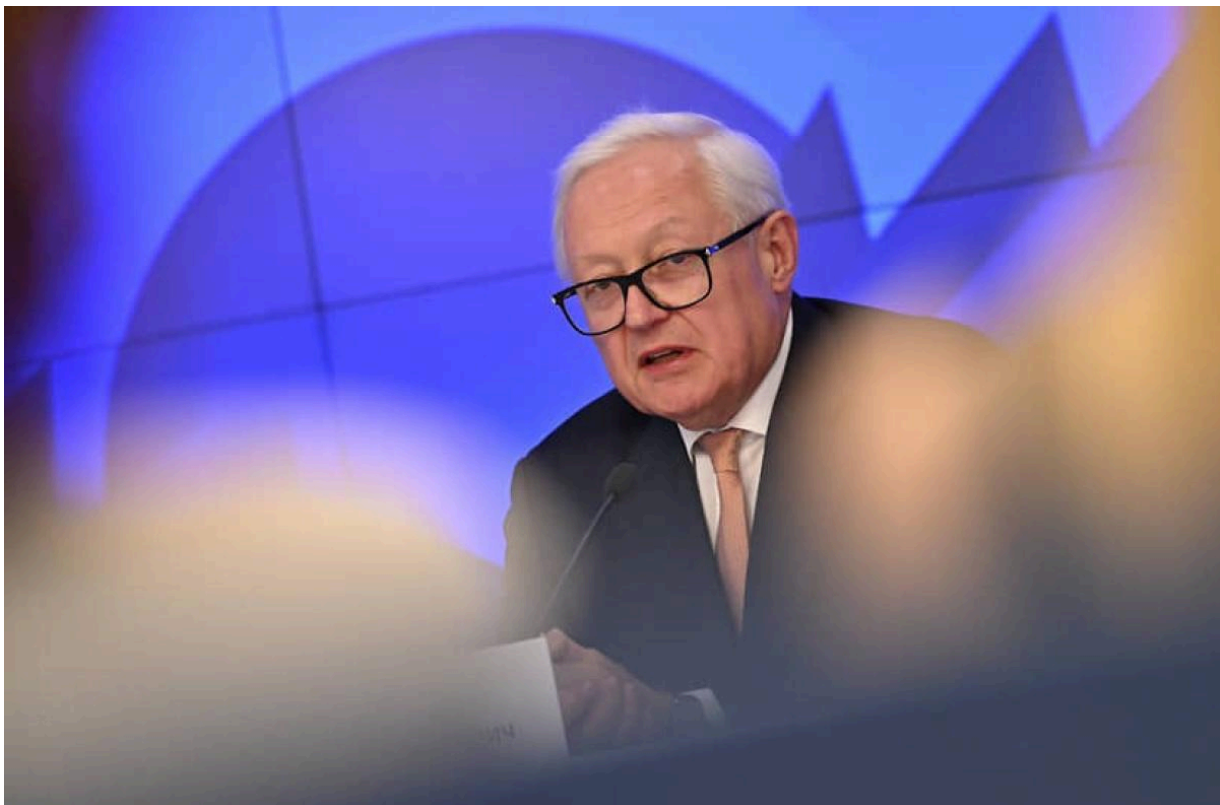
Sergey Ryabkov

Russia and the US did meet in Istanbul on February 27 and April 10, 2025, with the aim of normalizing the work of diplomatic missions and improving bilateral relations. As a result of the last consultation, the parties agreed to simplify the freedom of movement of diplomats and to develop a “road map” for seized Russian diplomatic property.