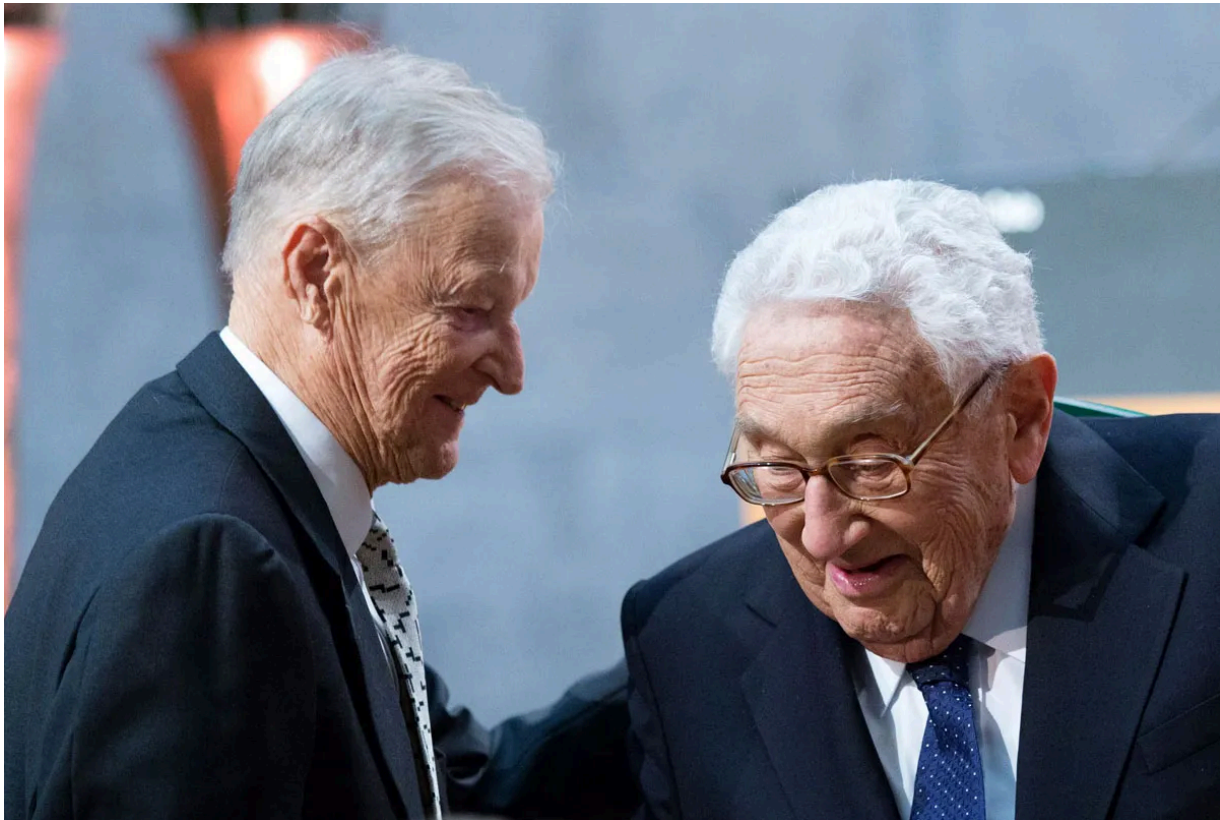
Zbigniew Brzezinski, left, with Henry Kissinger, December 2016

David Rockefeller did not “invent” Brzezinski , but he promoted him institutionally and strategically through his networks: first through the Council on Foreign Relations, then specifically through the Trilateral Commission. There, Brzezinski was given the stage to implement his ideas. He became Lyndon B. Johnson's campaign advisor from 1966 to 1968 and US President Jimmy Carter's national security advisor from 1977 to 1981. His book The Grand Chessboard: American Primacy and the Future of World Order , about Anglo-Saxon geopolitical strategy, is still a classic today.