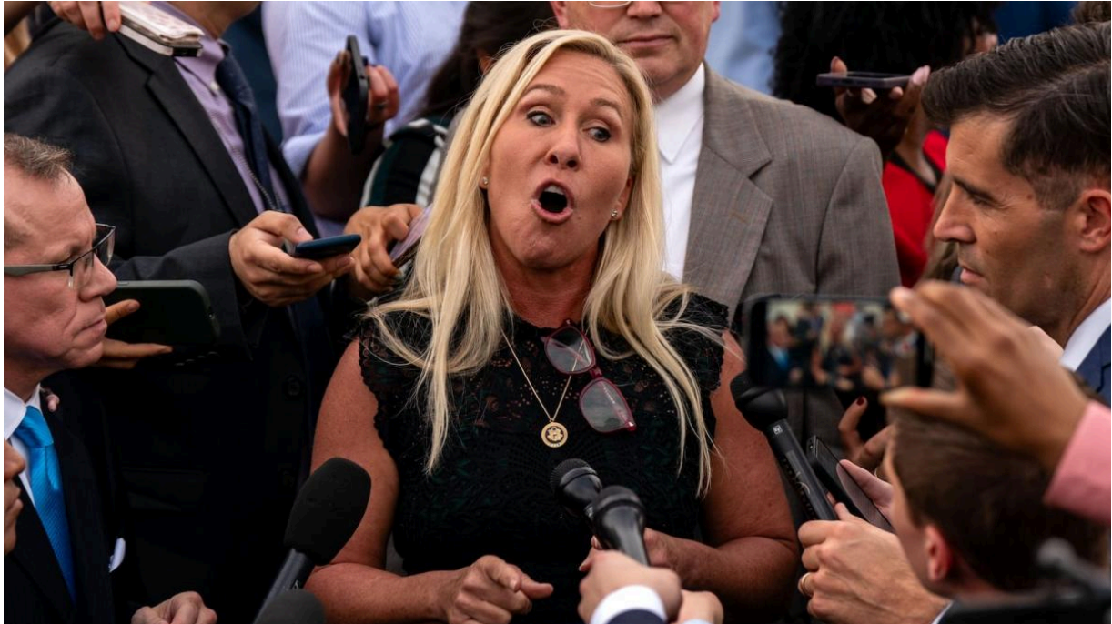
Marjorie Taylor Greene in action

Georgia Republican Representative Marjorie Taylor Greene (MTG) recently made a surprising and clear break with Donald Trump, despite having been one of his most loyal supporters for a long time. She told The Times that Americans are “tired” of conflicts in distant countries. She strongly condemned Trump's announcement to supply weapons to Ukraine via NATO. She said this was a betrayal of the “America First” principle. In her opinion, Trump is risking dragging the US into another war. She speaks of a broken promise: