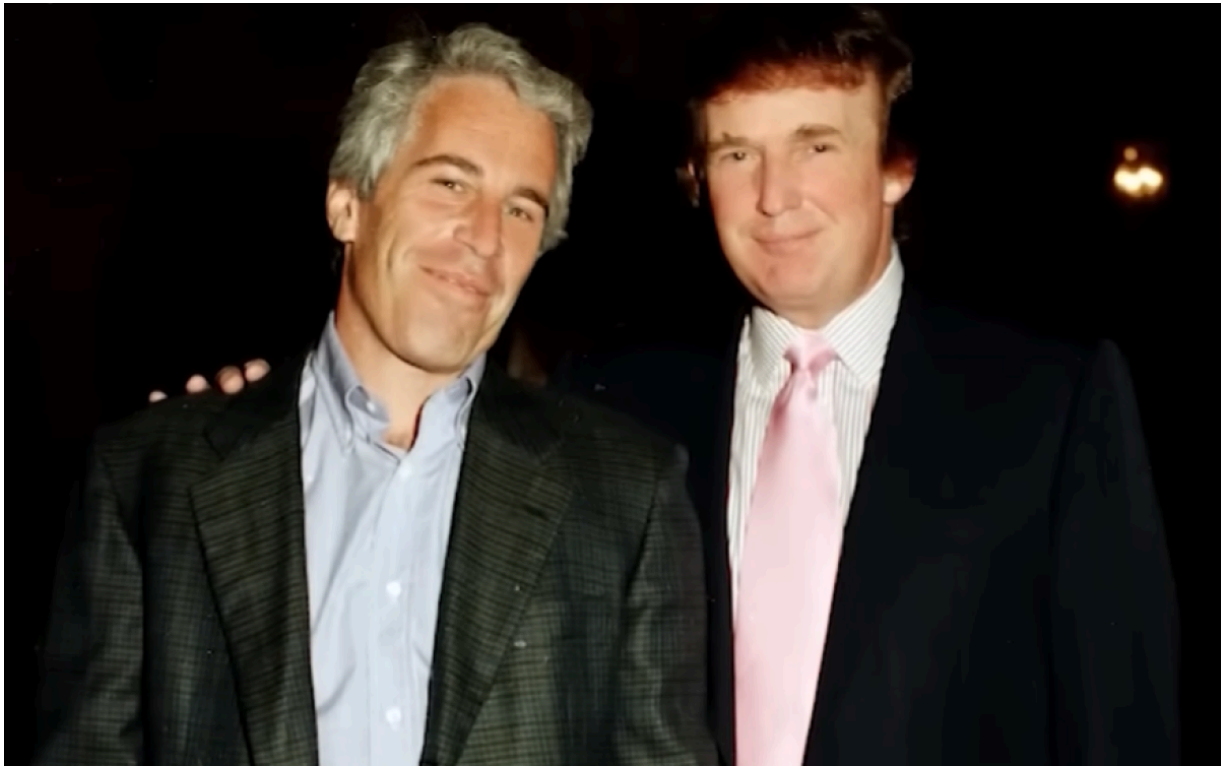
Jeffrey Epstein (left) with Trump (right) in better times, screenshot from a CNN broadcast

Carlson goes on to denounce the Trump administration's aggressive war policy. In this context, he conducted an interview with Texas Senator Ted Cruz , one of Trump's most important allies in the push for regime change in Iran, in which the senator was more or less completely dismantled.