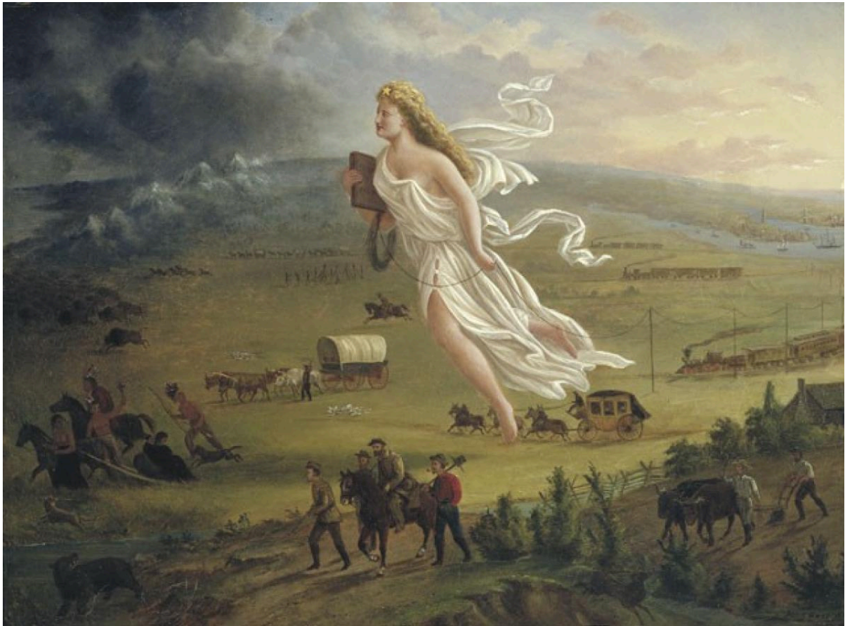
Painting by John Gast, ca. 1872

The religiously motivated political exceptionalism of the 19th-century “ Manifest Destiny ” is a crude copy of this idea. It states that the United States has a divine destiny to spread across the North American continent and beyond.