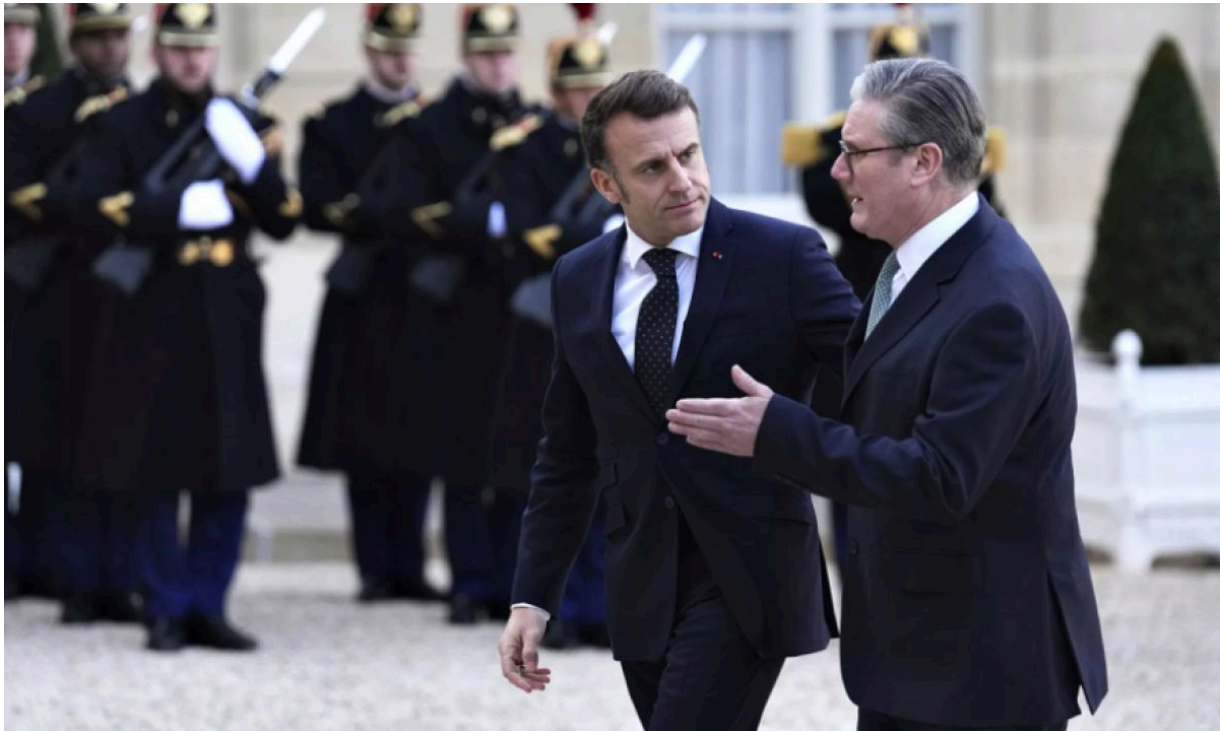
The outraged among themselves - Emanuel Macron and Keir Starmer

Europe has completely lost its head. Instead of dealing with the domestic political chaos in their countries and their own economies, Europe is now in danger of becoming geopolitically isolated.