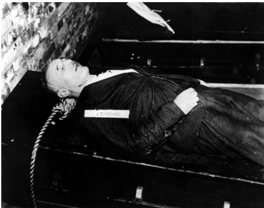
Hate propaganda can lead to a broken neck – Julius Streicher, former publisher of the newspaper "Der Stürmer"

A few gallows should be kept ready for the ladies and gentlemen responsible. That would be nothing new, by the way. Julius Streicher , publisher of the Nazi hate newspaper "Der Stürmer", was hanged in Nuremberg.