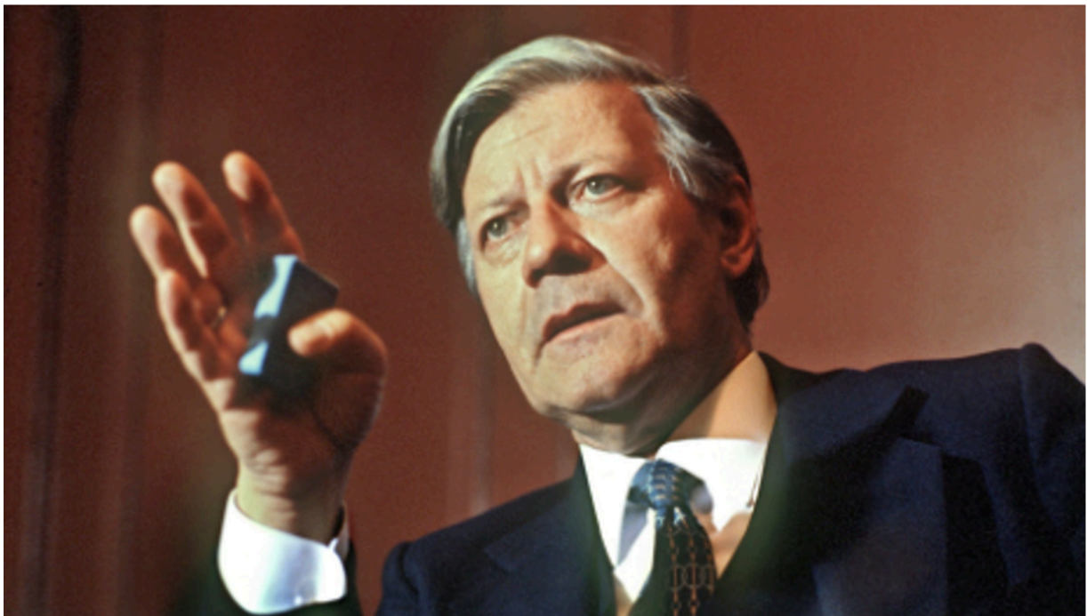
A man of stature and courage: Helmut Schmidt