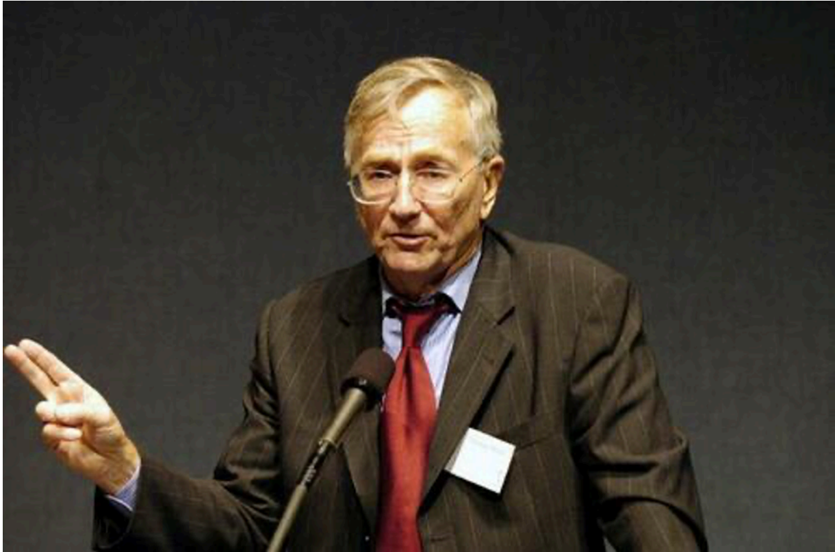
Seymour Hersh

"Last June, the Navy divers, operating under the cover of a widely publicized mid-summer NATO exercise known as BALTOPS 22 , planted the remotely triggered explosives that, three months later, destroyed three of the four Nord Stream pipelines, according to a source with direct knowledge of the operational planning."