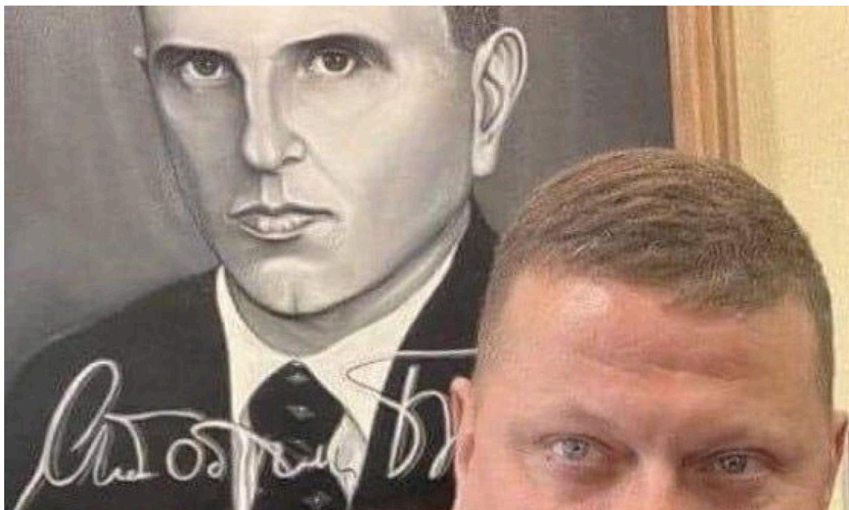
Valeriy Zaluzhny, former commander-in-chief of the Ukrainian Armed Forces, takes a selfie with his idol Stepan Bandera.

Zaluzhny, 50, was only so popular in western Ukraine because he is a likable personality, constantly cracking jokes and playing the buffoon, a comedian almost like Zelensky. Zaluzhny is an ethnic Ukrainian, one of the few Western Ukrainians to have held the highest command and, as a junior officer who only entered the officers’ academy in 2005, had no connections to the Soviet military or Russia. He was characterized by his closeness to the fascist Right Sector, with a large portrait of the Nazi war criminal and national hero Bandera in his office, friends with the leaders of neo-Nazi battalions such as Azov, Svoboda and others. Badges of SS units such as Das Reich, Totenkopf, Galicia and others, which also have blood on their hands, were very popular with the armed forces under his command. Ukrainian armored vehicles bear the insignia of the Wehrmacht of Nazi Germany. And, of course, the majority of Western media have remained silent about this.