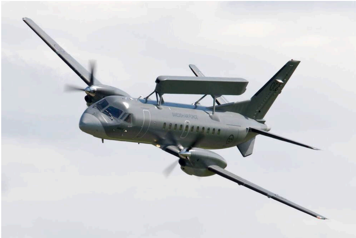
SAAB 340 AEW Erieye

Sweden also trained personnel for this purpose in Poltava. The completely surprising resignation of the Swedish foreign minister the morning after the Russian attack should not surprise anyone.