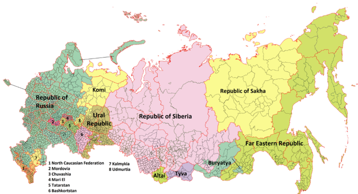
Russia after the planned dismemberment

The approach to Russia was completely different. Russia was never supposed to become a partner of the West and Professor Sachs shows how, as an advisor to Gorbachev and then Yeltsin, he failed to organize support from the West. The US's goal was not the recovery of Russia, but the disintegration of the country into small, digestible portions, which would then be taken over by puppets from the US. This plan is still being pursued today with enormous effort and is currently culminating in the war in Ukraine. We already reported on this last summer in an article entitled " The planned dismemberment of Russia ".