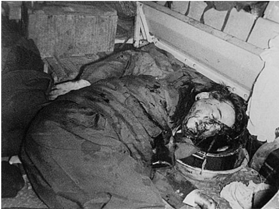
The typical end of an American puppet: Ngo Dinh Diem

Europe, especially Germany, will be furious. As a loyal vassal of US interests in Ukraine, Germany has ruined itself economically and socially and contributed to the destruction of Ukraine with its military and financial support. If Trump becomes president, he will abandon Germany and leave the bill for reconstruction on the table in Berlin.