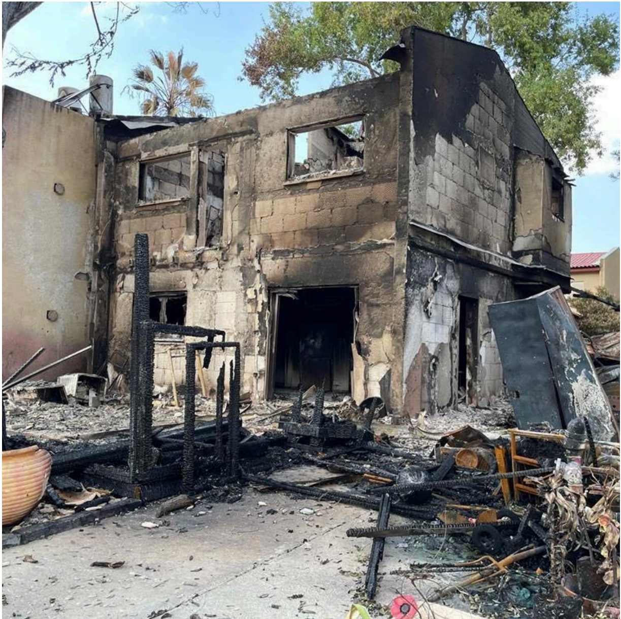
One of the many houses in Kibbutz Beeri that was apparently shelled with heavy weapons.

It is impossible that Hamas fighters could have caused this destruction, as they only had light weapons at their disposal. In addition, those who want hostages do not murder blindly, because hostages are only useful if they are alive.