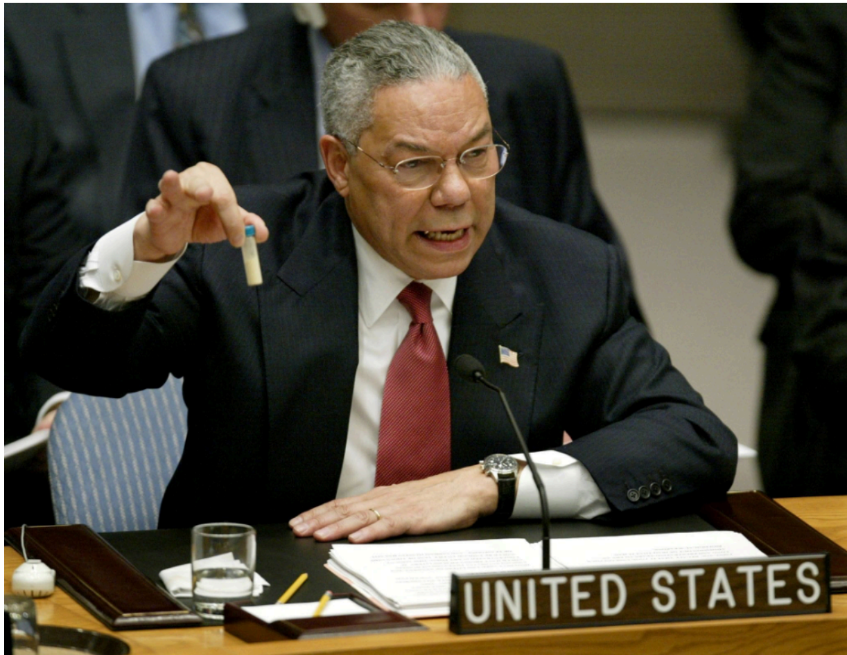
Fairytale hour with Colin Powell - will it work again?

This tactic was also used in 2002/2003 to create a justification for the attack on Iraq, which the US claimed had weapons of mass destruction.