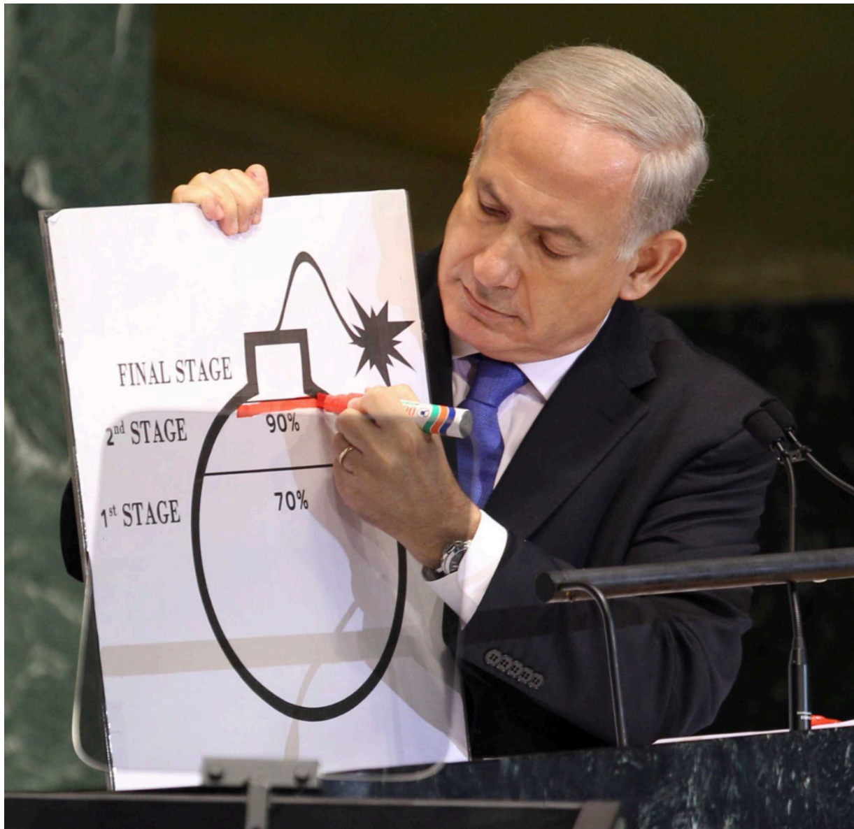
Natanyahu in front of the UN

This propaganda drumbeat is old hat. This doomsday scenario has been "imminent" for decades.