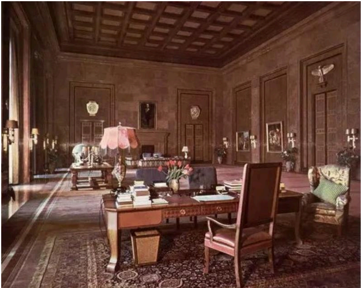
Hitler's office in the Reichskanzlei - bombastic

The discussion in Germany about Hitler never went beyond describing him as a monster. It was easier to sweep this “monster” under the carpet and flatten everything associated with him. If the Obersalzberg and the Reich Chancellery were still standing, Germans would be aware of Hitler’s megalomania – nothing to do with being close to the people.