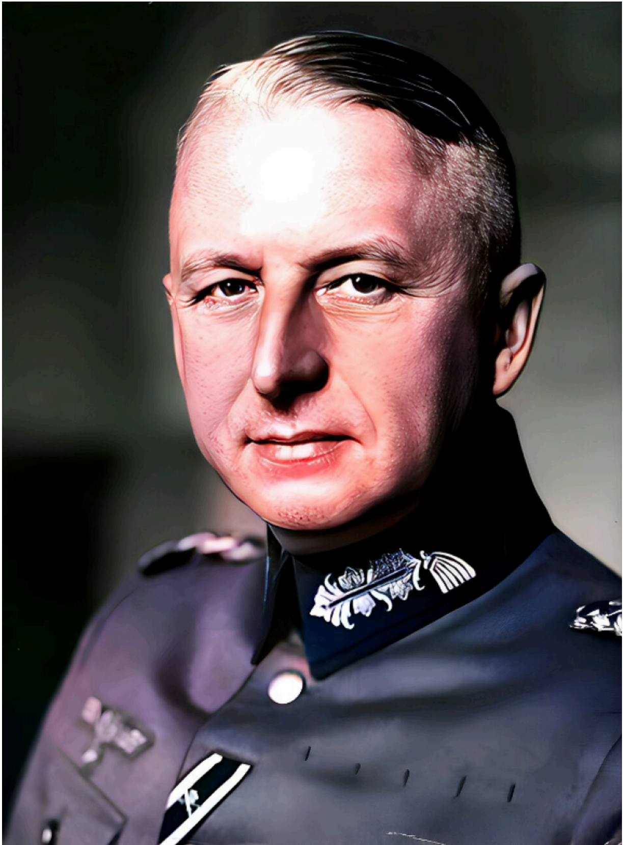
War criminal who was stylized as a hero and helped build today's German armed forces – Erich von Manstein

Dr. Ohlendorf testified to this effect: The task forces were not only assigned to the army groups, but also subordinate to them. Officers from the slaughter groups were assigned to Manstein's command group to coordinate the slaughter with the officers. In his testimony, Ohlendorf stated, among other things, that Manstein's