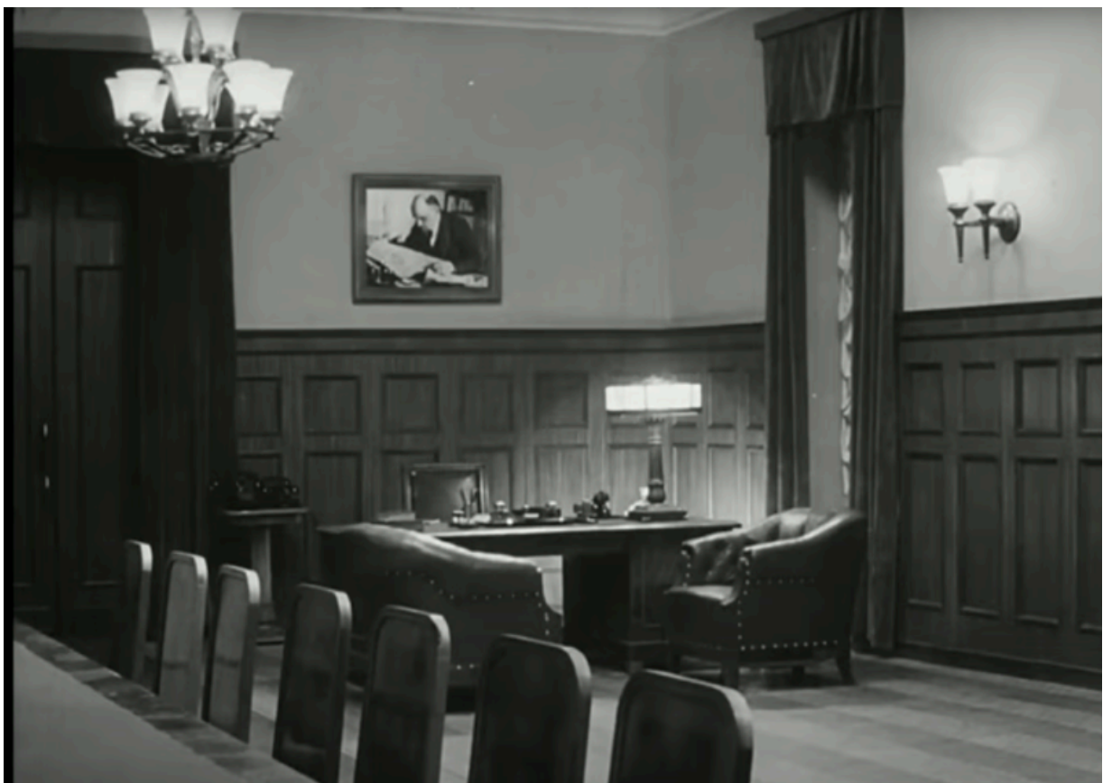
Arbeitszimmer Stalins im Kreml 1941 – Standbild aus Video

Until May 1945, the Germans were lied to by Joseph Goebbels, then by others. We will now discuss how these lies completely destroyed the Germans' comprehension of history, using a few examples.