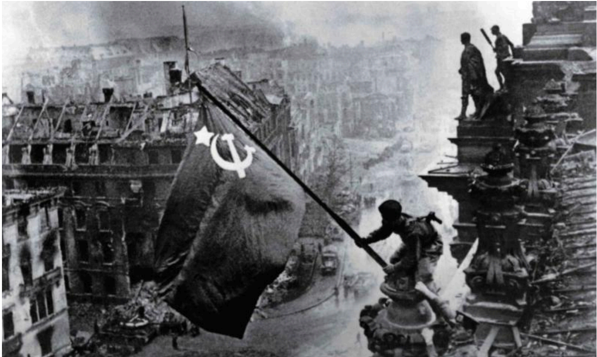
2. Mai 1945, Dach des Reichstagsgebäudes in Berlin.