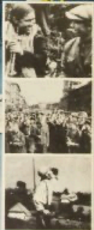
Film poster "The Battle of Russia"

Distributed by 20 th CENTURY-FOX FOR THE WAR REPRESENTATIVE COMMITTEE - MOTION PICTURE INDUSTRY