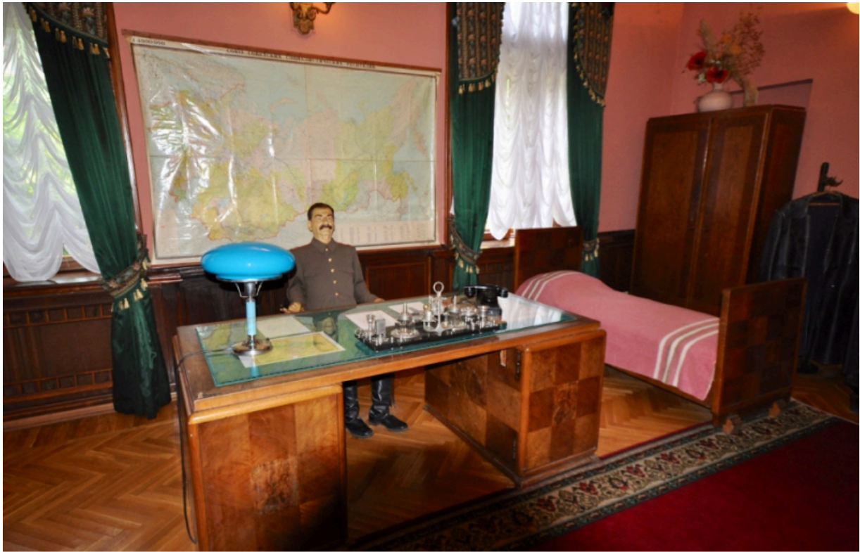
Study in Stalin's dacha in Sochi.