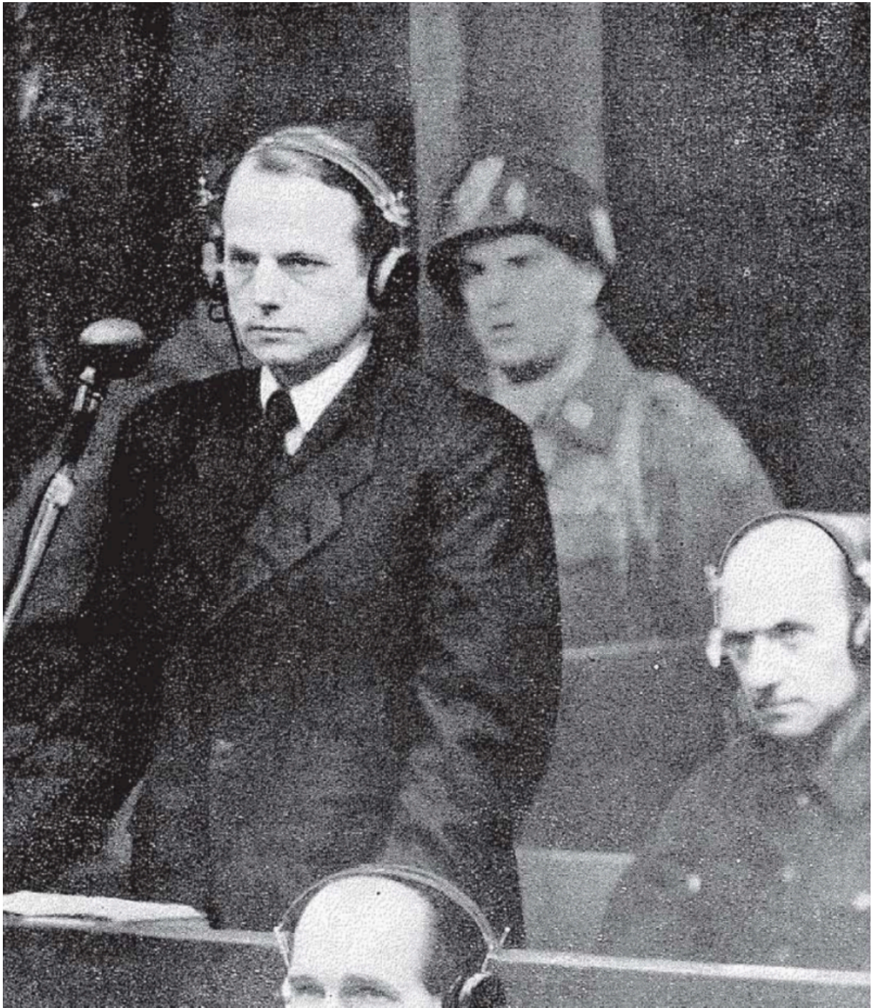
Otto Ohlendorf pleads “not guilty,”

Fourteen of them received the death penalty, two were sentenced to life imprisonment, and the rest received prison sentences ranging from 10 to 20 years. However, the consistent severe punishment of the perpetrators in the Einsatzgruppen trial evaporated into thin air: of the 14 sentenced to death, only three were executed, including Ohlendorf. All the other convicts were released between 1951 and 1958 .