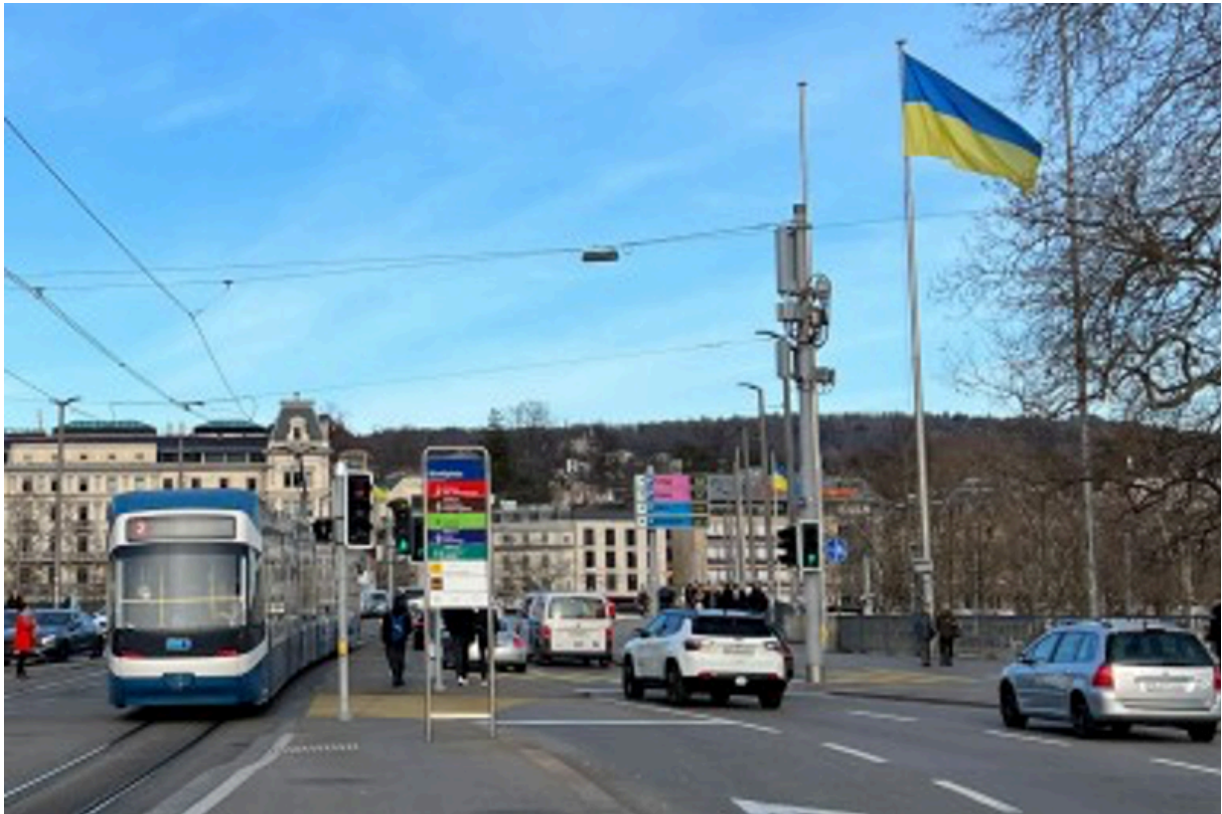
Ukraine is the new Switzerland! - Ukrainian flags of Zurich

Russia's demise has been enthusiastically heralded since last spring. Remember when, in the spring of 2022, the Western media announced in unison that the Russians would run out of ammunition by May, that civil war was breaking out in Russia, that sanctions were bringing Russia to its knees, that Putin was dying, and that Ukraine was the new Switzerland?