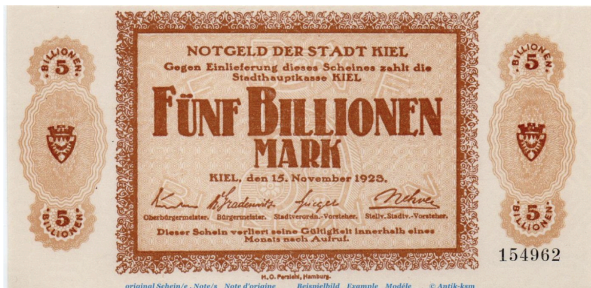
5 Trillion Mark banknote from 1923

A central bank cannot go bankrupt because it can print unlimited amounts of money, so it is theoretically impossible for a banknote holder to lose everything. I use the word "theoretically" because it is quite possible in practice and has already happened.