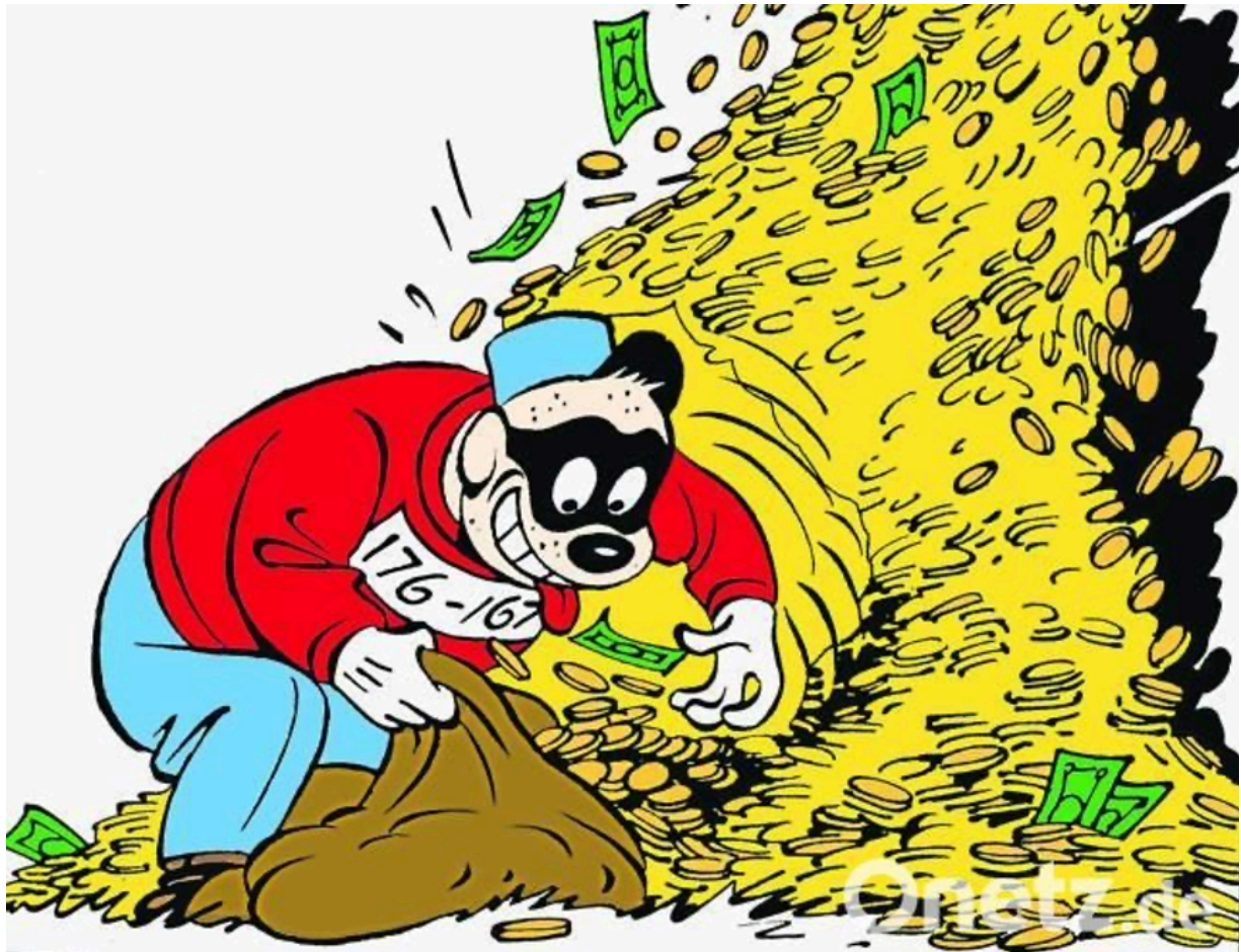
Tank crackers at work

The biggest advantage of physically held gold now is that it is not exposed to the counterparty risks described. The only risk a person has if they hold gold physically is theft. Scrooge Duck can tell you a thing or two about it.