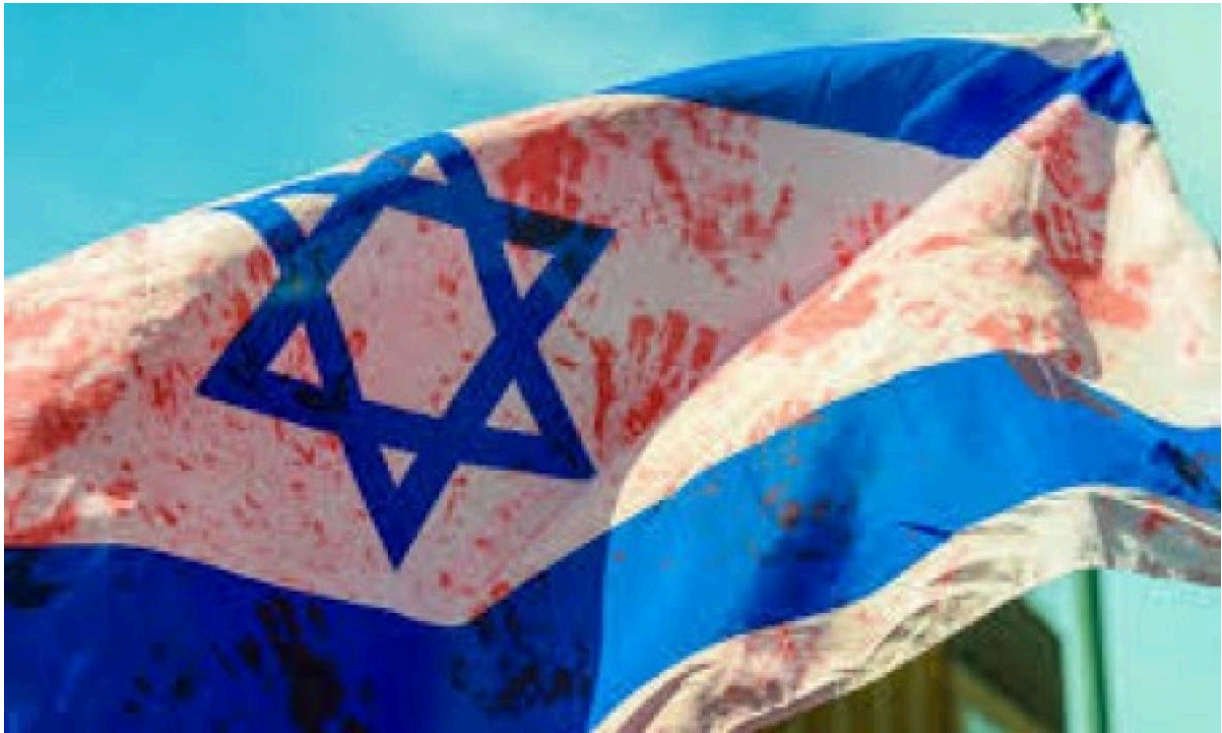
Cover picture of our series “Israel - from victim to perpetrator to victim - a back and forth for 80 years” - November 5 to December 29, 2023

Part 5 covers the period from 1993 to the present. We looked at the Oslo Accords of that year, as a result of which the PLO disappeared into insignificance and Hamas became increasingly important for the Palestinians.