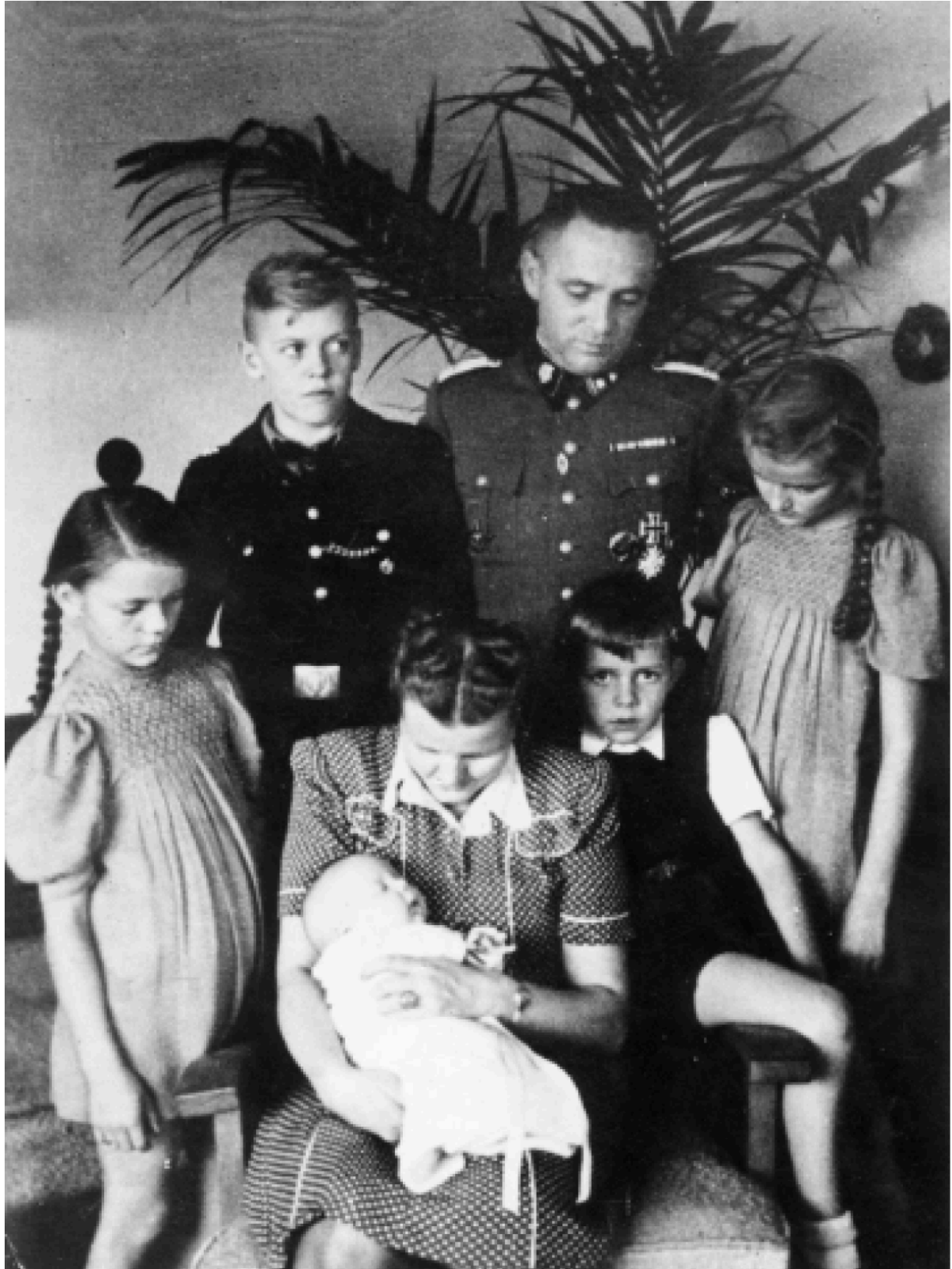
Rudolf Höss shows himself in his villa in Auschwitz as a loving father of five children (1943)

As a father, I cannot comprehend condoning such an act under any circumstances. Obviously, people who endorse - or even carry out - genocide can activate a mechanism in their conscience that is able to distinguish between their own children and the children of “sub-humans”. There are certainly historical examples.