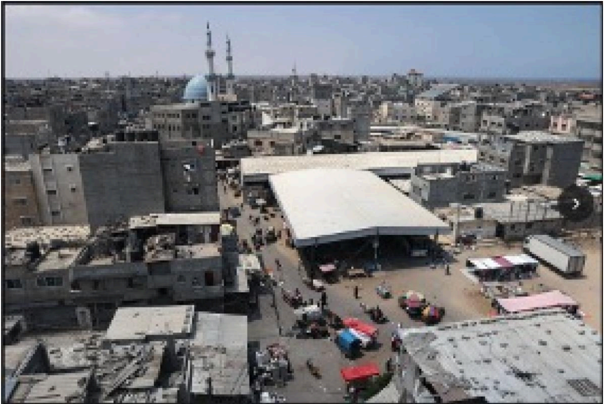
Rafah before the destruction