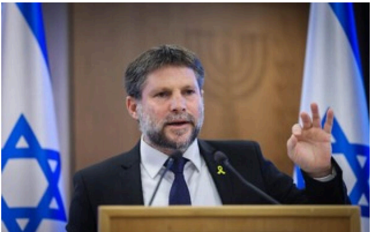
Bezalel Smotrich

For example, Bezalel Smotrich , the Israeli finance minister in October 2024: