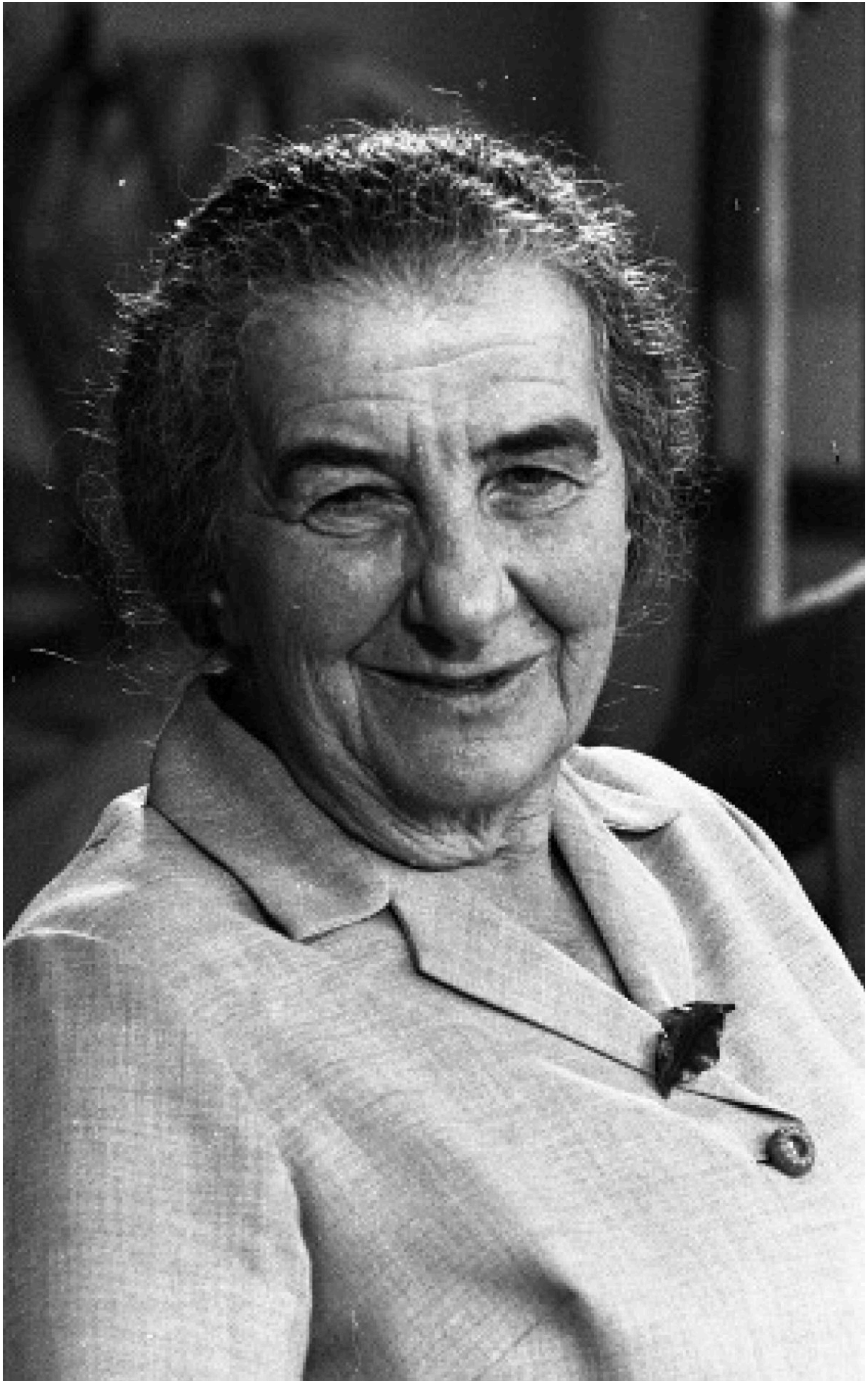
Golda Meir - Israeli Prime Minister 1969-1974 - looked more grandmotherly than she was.