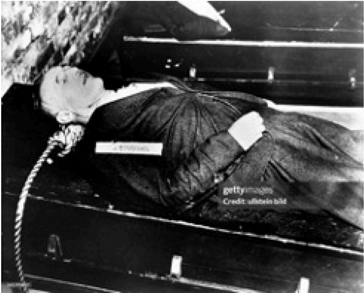
Writing can be dangerous - Julius Streicher at the end of his career - October 16, 1946

In the following, we analyze the practices and statements of two media companies from German-speaking countries, representative of almost all media companies in the West, although, in contrast to Europe, critical voices are becoming louder in the US.