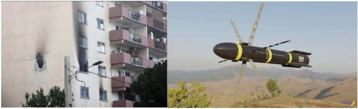
Hellfire rocket - left: Result; right: Hellfire rocket

They provided intelligence information. They refueled the Israeli bombers over Syria, which in itself is a massive violation of international law. We hear that the German war spirit has now also awakened, so that the German government is also sending its planes.