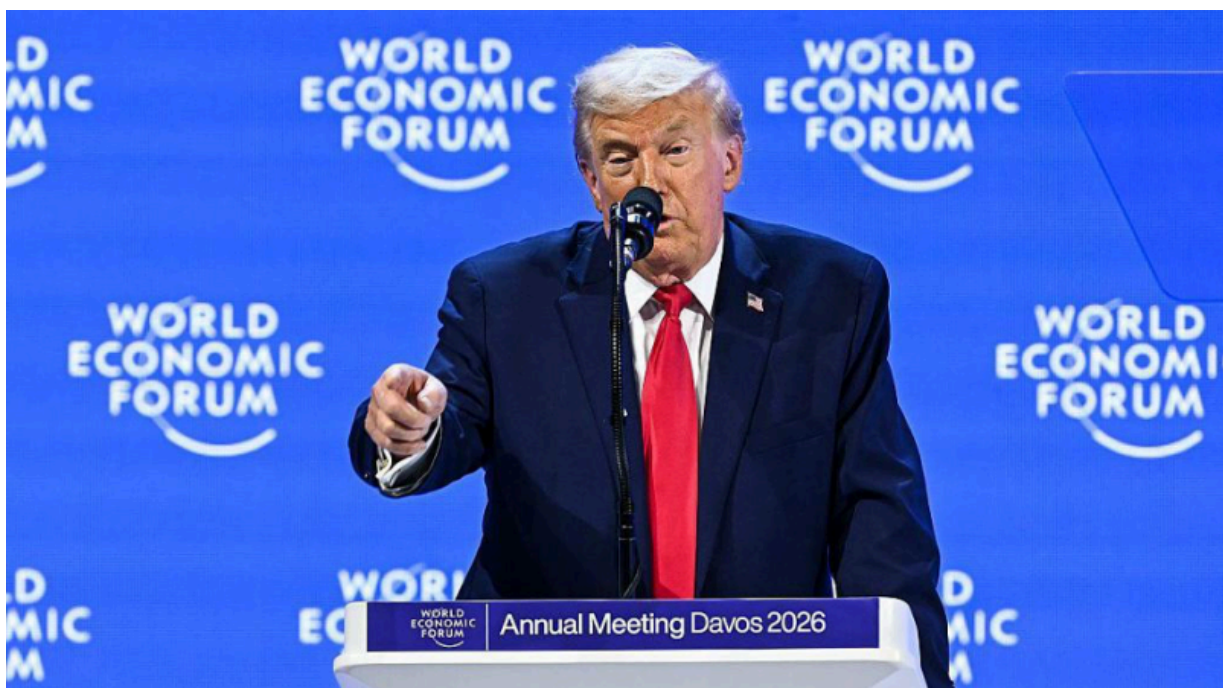
President Trump, WEF, Davos, January 21, 2026

On January 21, Trump said that “the world is not safe unless we have complete and total control over Greenland.” In his Davos speech on January 21, he announced that “we [NATO] never wanted anything or never got anything” – all the United States wants is a place called Greenland. He went on to say, “I don't have to use force. I don't want to use force. I won't use force.”