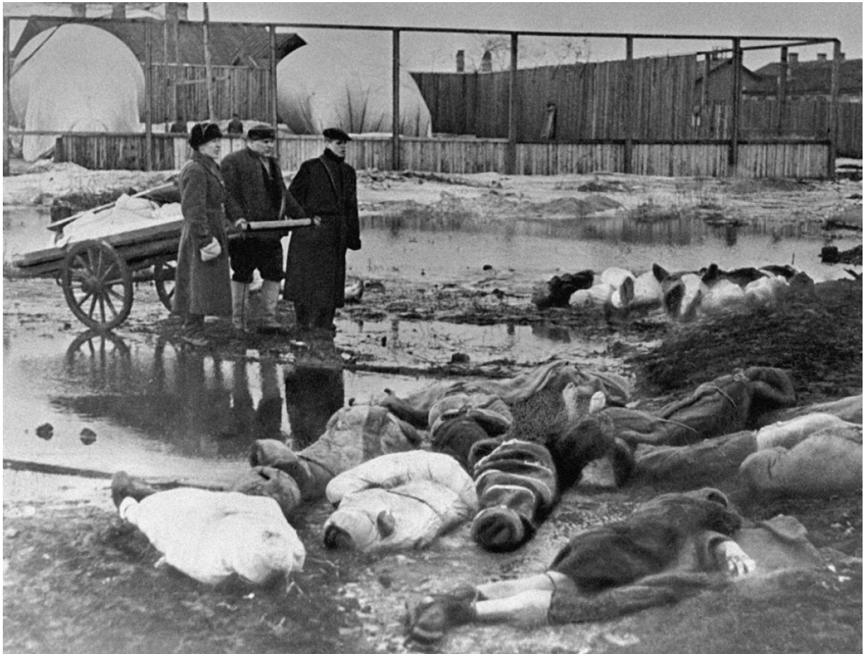
Three men bury victims of starvation at the Wolkowo Cemetery during the days of mass deaths, October 1942; https://de.wikipedia.org/wiki/Leningrader_Blockade#cite_ref-10

The city was also severely damaged by air raids and artillery fire, leaving many buildings in ruins.