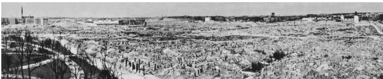
The Warsaw Ghetto after its destruction:

https://de.wikipedia.org/wiki/Warschauer_Ghetto#/media/Datei:Warsaw_Ghetto_destroyed_by_Germans,_1945.jpg