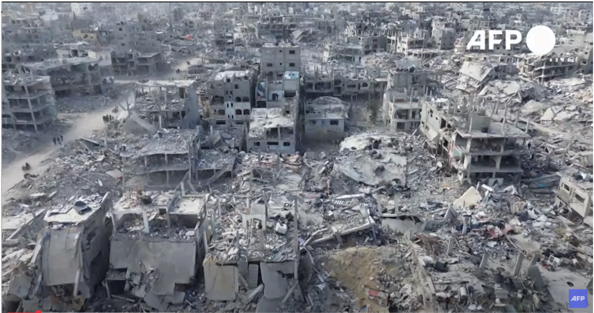
Rafah today – Source: AFP News Agency

Stroop documented the outcome of the suppression of the uprising and the systematic destruction of the ghetto in an official report entitled “There is no longer a Jewish residential district in Warsaw!”