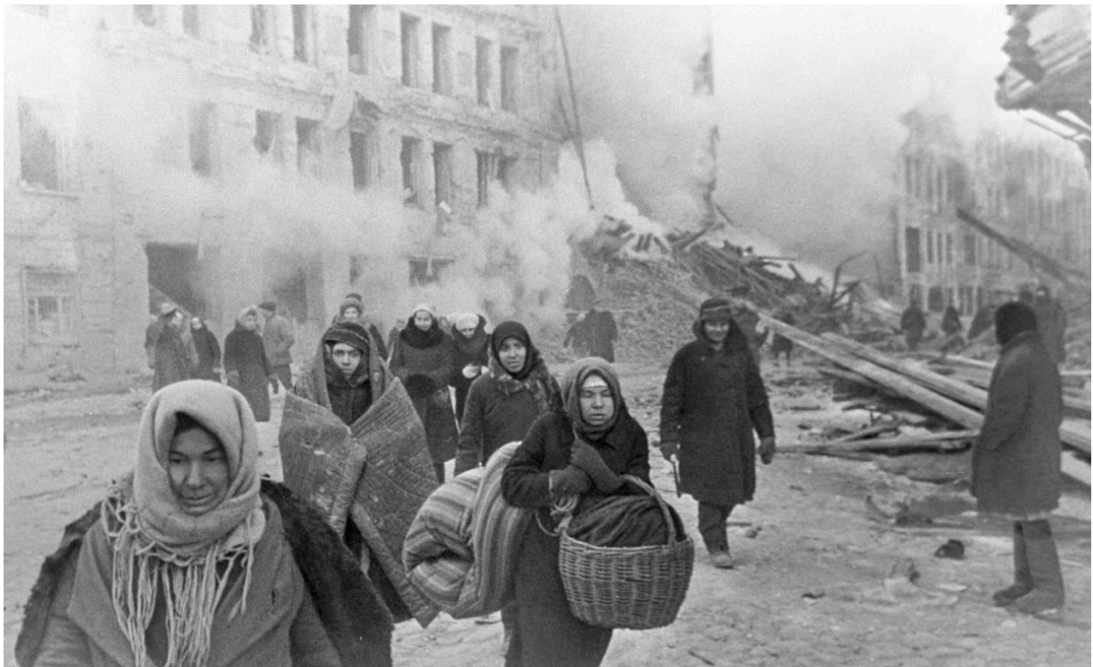
Leningrad residents leave their bombed-out homes, December 1942; https://de.wikipedia.org/wiki/Leningrader_Blockade#/media/Datei:RIAN_archive_2153_After_bombing.jpg

The city was also severely damaged by air raids and artillery fire, leaving many buildings in ruins.