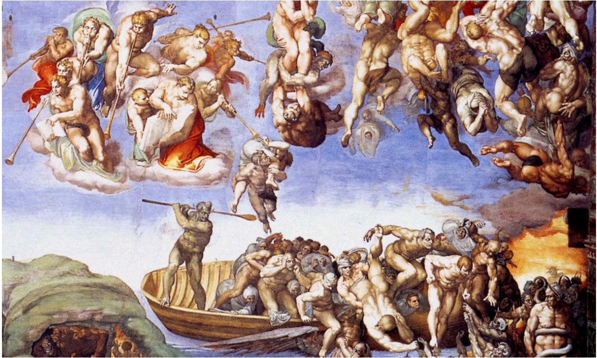
Michelangelo Buonarroti: The Last Judgment – Fresco in the Sistine Chapel in the Vatican, 1536–1541