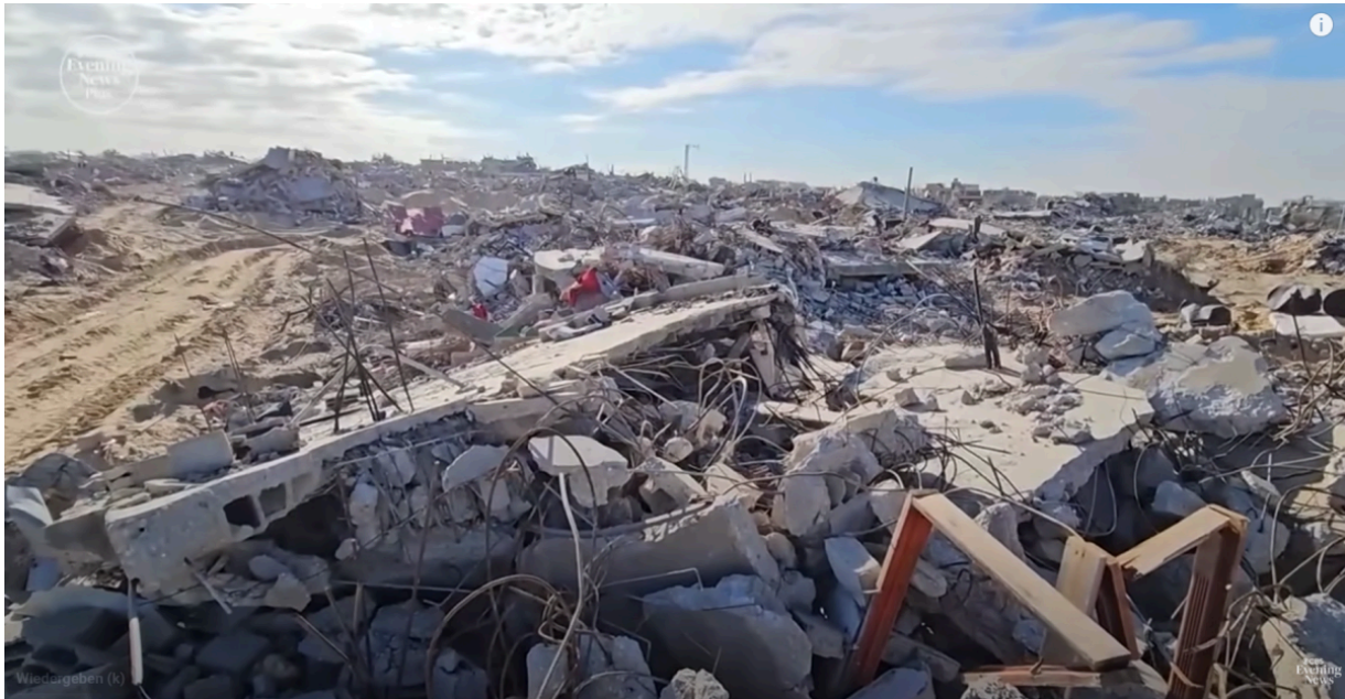
Screenshot from CBS video dated July 15, 2025

But that's not where the parallels end. In Palestine, Israel is not only destroying civilian buildings and driving out and wiping out the local populations, it is also using starvation tactics, which were classified as crimes against humanity at the Nuremberg trials.