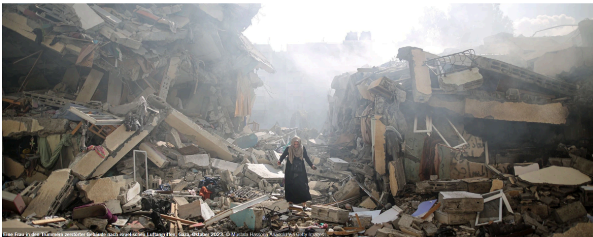
Eine Frau in den Trümmern zerstörter Gebäude nach israelischen Luftangriffen, Gaza, Oktober 2023.

It should be noted that this is the course of action being taken: Bezael Smotrich (Israeli Minister of Finance) said in early May 2025 that Gaza would be completely destroyed. The same minister had already declared in August 2024 that it was “justified and morally acceptable” for Israel to “starve 2 million civilians” until “the hostages are returned.” His counterpart, Itamar Ben-Gvir (Minister of the Interior and Security), made the following statement : “Food and aid depots should be bombed to exert military and political pressure.” In January 2024, he announced : “The only humane solution for Gaza is mass deportation.” These were not empty words or propaganda slogans. The world watches daily as these plans are barbarically implemented (for many examples, see here , here , and here ).