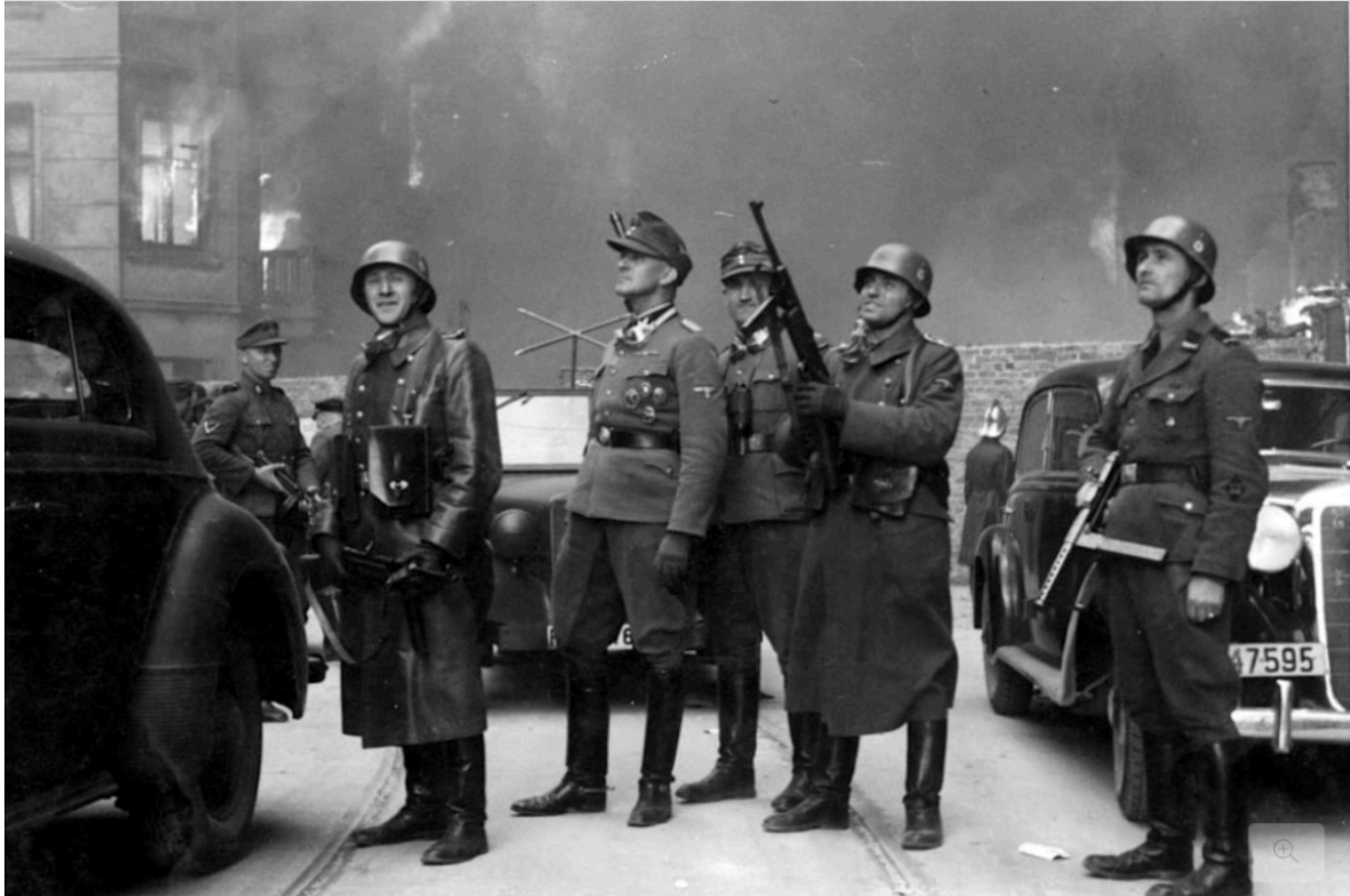
SS Brigade Leader Jürgen Stroop (center) inspects the destruction of the Warsaw Ghetto; Source : picture alliance /United Archiv

The following individuals were responsible for carrying out the order: